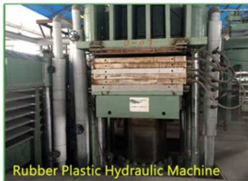
Rubber Plastic Hydraulic Machine