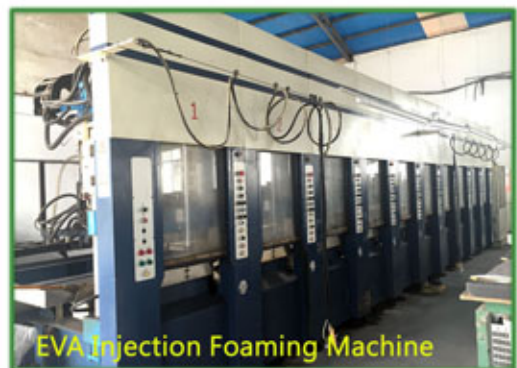
EVA Injection Foaming Machine